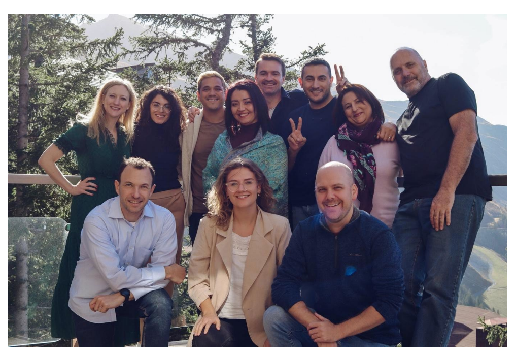
The ALLMEP international team in Avoriaz, French Alps

Helping ALLMEP to have a long-overdue team retreat by providing them a place to gather helps our mutual beneficiaries.